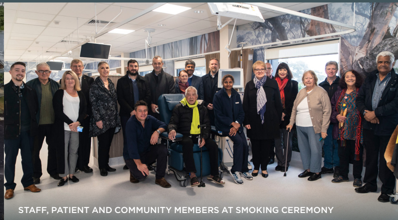
STAFF, PATIENT AND COMMUNITY MEMBERS AT SMOKING CEREMONY