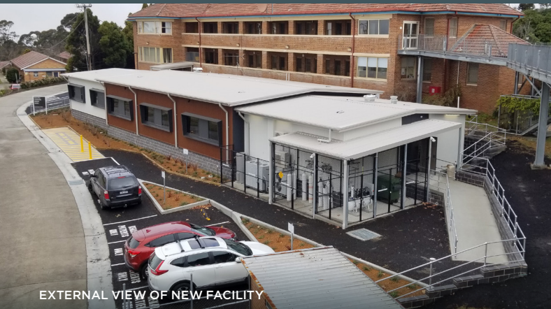
EXTERNAL VIEW OF NEW FACILITY