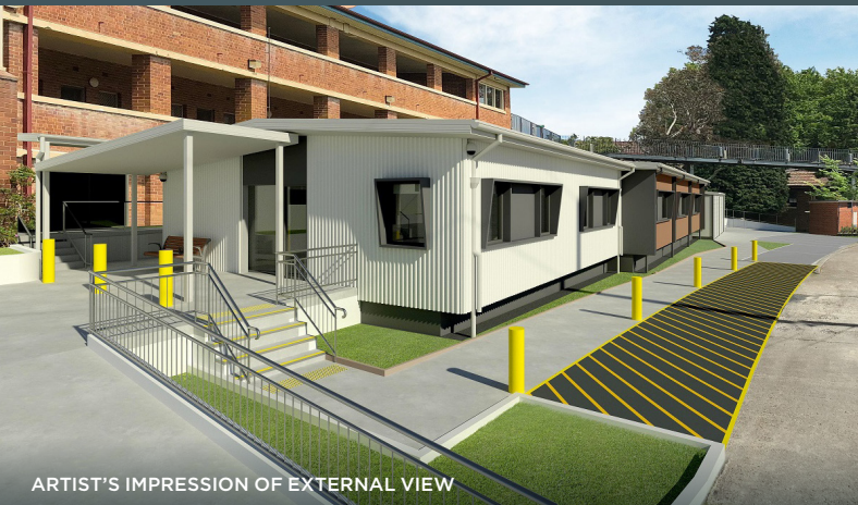
ARTIST'S IMPRESSION OF EXTERNAL VIEW