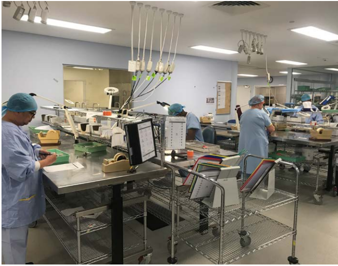
Image taken in current CSSD unit

“From there, we began working with sterilising consultants and the architects to see how the department could flow within the new space.”