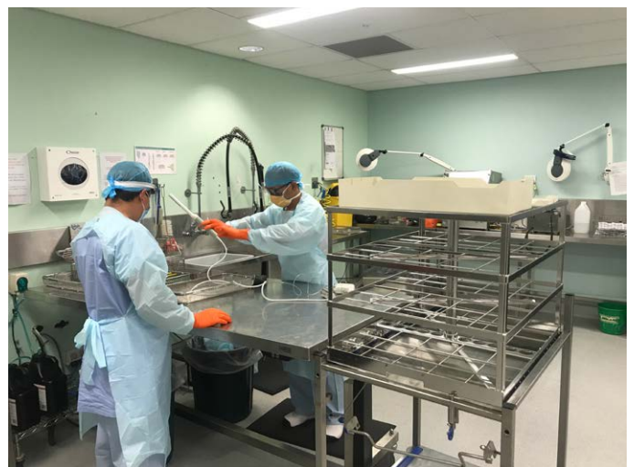
Image taken in current CSSD unit

“While they are similar to what we have now, they will have some enhanced design features that will better suit our capabilities.”